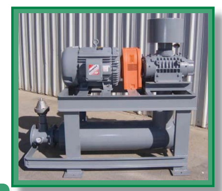
AirMac Blower System (shown with silencers)