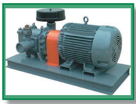
AirMac Blower System (without silencers)